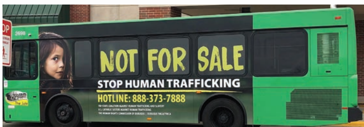
CHMs contributed to a bus and billboard awareness project focused on Human Trafficking.