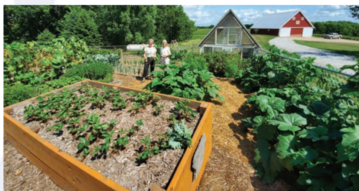
The gardens at The Prairie Retreat provide nutritional food for our visitors and utilize OLPR compost and rain-barrel water.