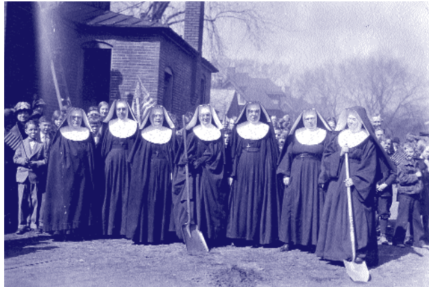
1925 - Fort Madison, Iowa Ground Breaking

ministry. Many Sisters still work in parishes, but some are part of diocesan and other organizational units working to enable and empower people in widely separated places in several countries. The 19th century Sisters cared for the educational, health, and social needs of European